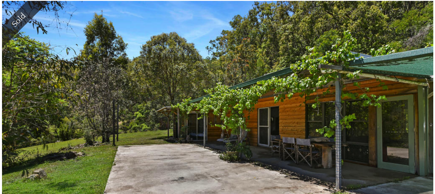
Lot 146 Dairy Arm Road, Laguna