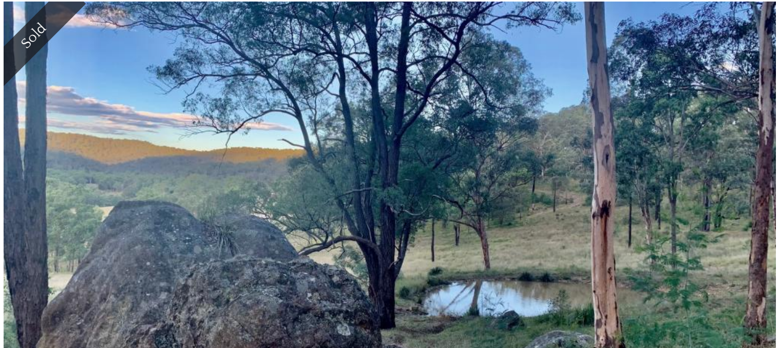
Lot 17 Putty Road, Howes Valley